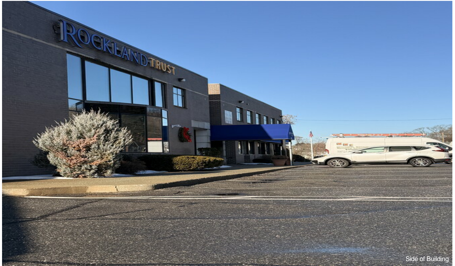
Side of Building